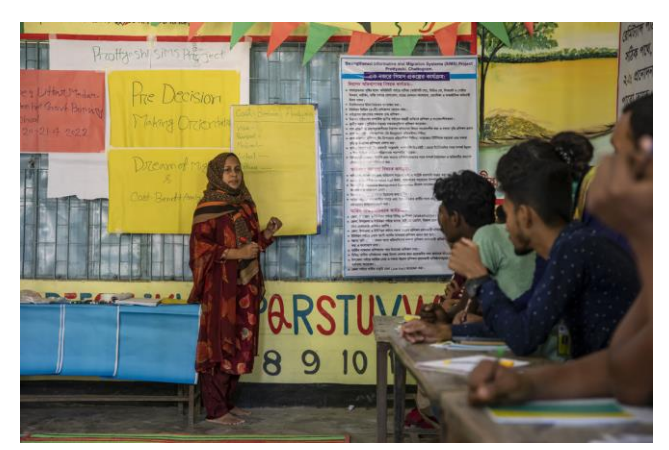
A cost-benefit analysis session in Chattogram.