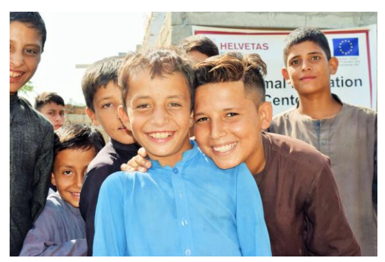
Afghan children in front of an educational space.

Helvetas is responsible for the Education in Emergencies (EiE) component of this project. The children of Afghan families are identified to enroll in the non-formal education (NFE) and public school systems through bridging and catch-up programs. A "surge model" approach is employed for the contingency planning and preparedness response in case of a massive influx near the borders. The NFE teachers' capacities are also enhanced in psychosocial support and children with disabilities are provided with assistive devices to enable them to participate.