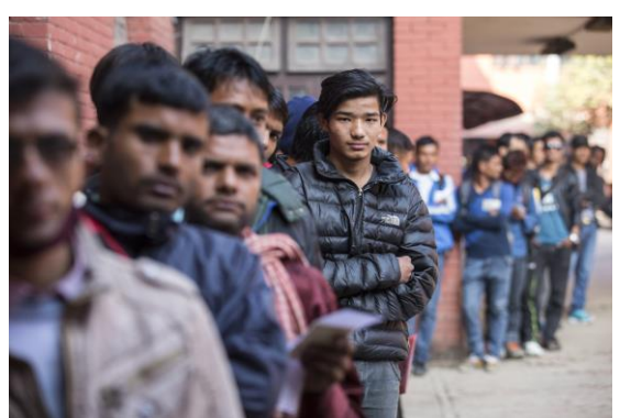
Waiting line in front of an MRC in Sindhuli district.

The Safer Migration (SaMi) program is a joint initiative of the governments of Nepal and Switzerland. It aims to make labor migration safer and more beneficial for Nepalese migrant workers and their families, as well as for society as a whole. The program focuses on five main components: i) access to quality information and advice on safe labor migration, ii) access to legal services, iii) support for psychosocial services, iv) financial education and v) skills development.