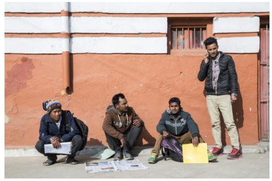
Individuals in front of the information centre

The project adopts a two-pronged approach: (1) it focuses on the services required by returnee migrant workers and their families (demand side) and (2) it addresses the roles of the three levels of government in creating an enabling and protective environment for service provision (supply side), alongside the private sector.